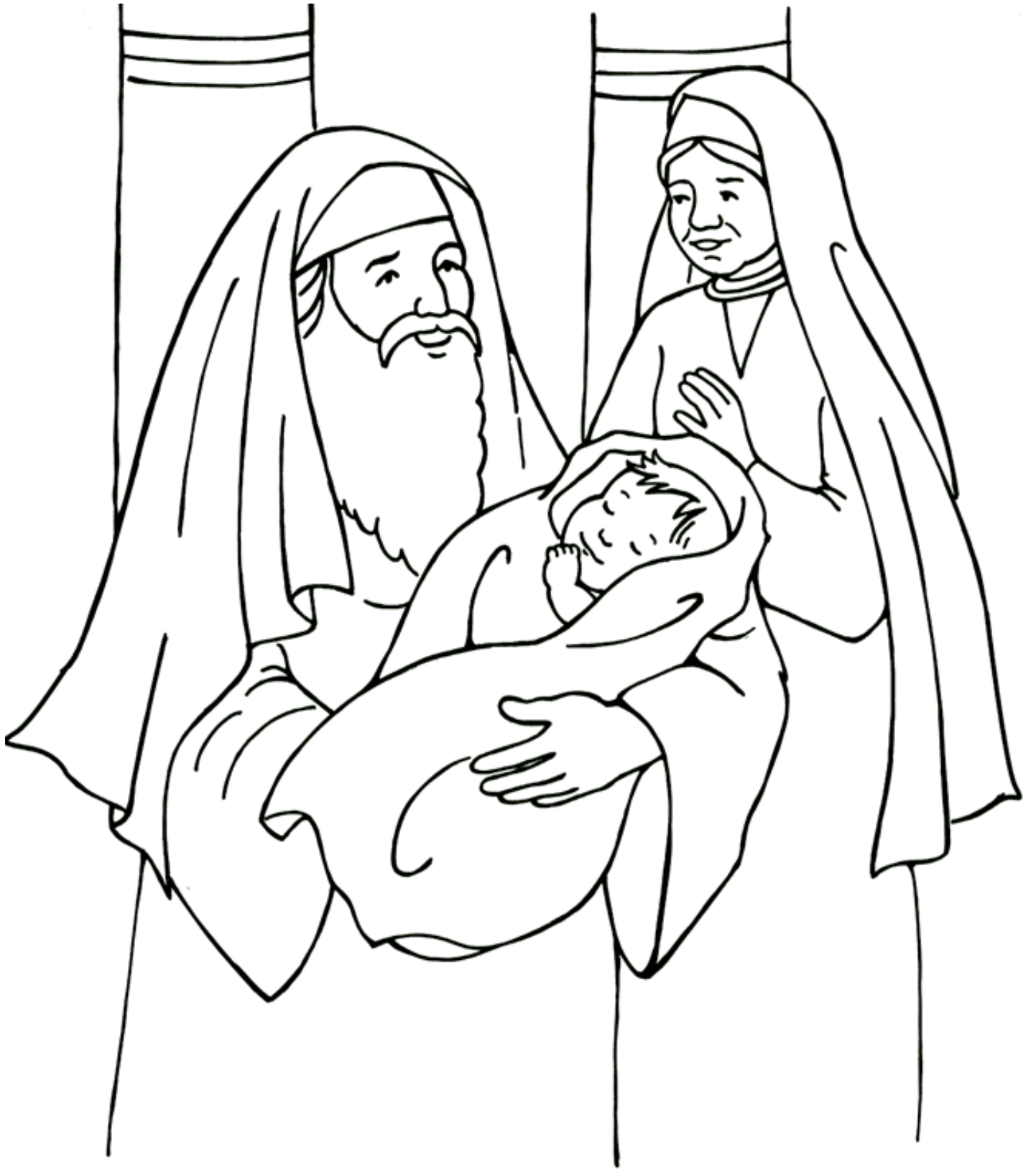
Simeon and Anna Thank God Luke 2